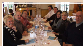
A few happy wine tasters